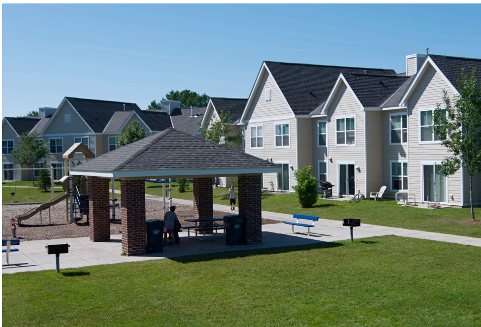
Prairie Crossings, Lakeville, Minnesota, was one of the affordable housing developments studied.

Whether in the Twin Cities or elsewhere in the country, the evidence is overwhelming: providing quality housing that lower-income families can afford poses no threat to area property values.