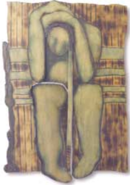
Park Bench | 1996, oil on wood construction, 20 x 67 in.