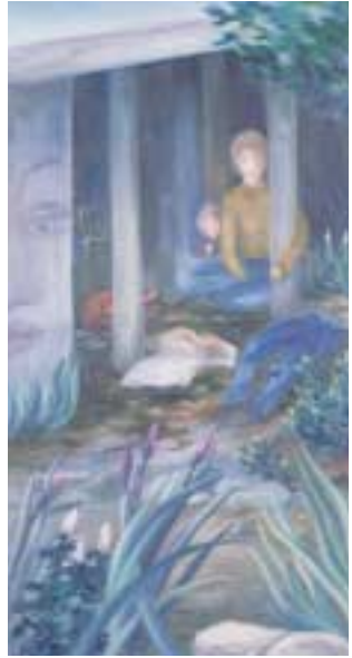
Evening Under the Sidewalk | 2000, oil on canvas, 24 x 48 in.