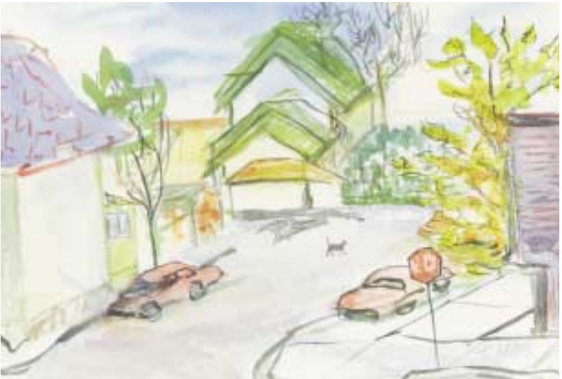
Tracy Moos | Across the Street | 1997, watercolor, 16 x 12 in.

Through the work of 20 local artists, the art exhibit portrays a wide range of housing situations and circumstances—from the stark images