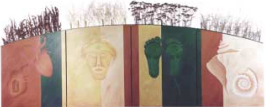
Outgrowth Beyond the Walls, Hearts, Mind, Body, Spirit |2000, acrylic on masonite, 129 x 52 in.