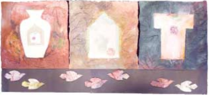
Vessel, House, Garment | 2000, mixed media, 72 x 32 in.