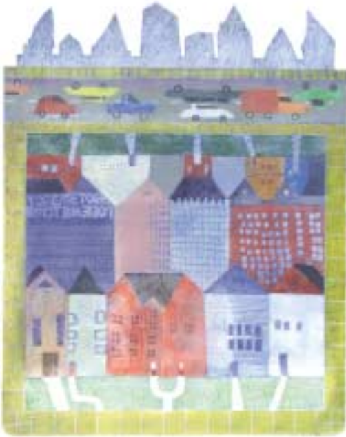
A Place 2 Be Me |2000, monotype, 38 x 48 in.