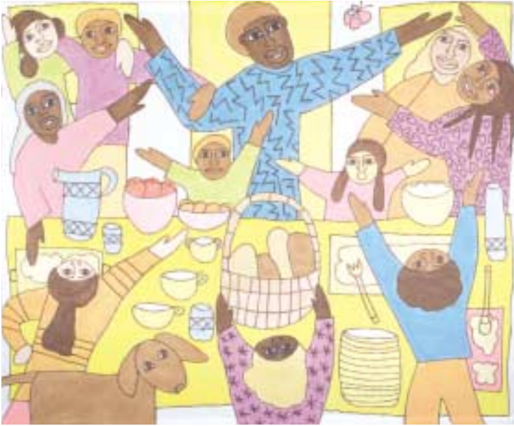
The Housewarming | 2000, acrylic on muslin, 72 x 60 in.