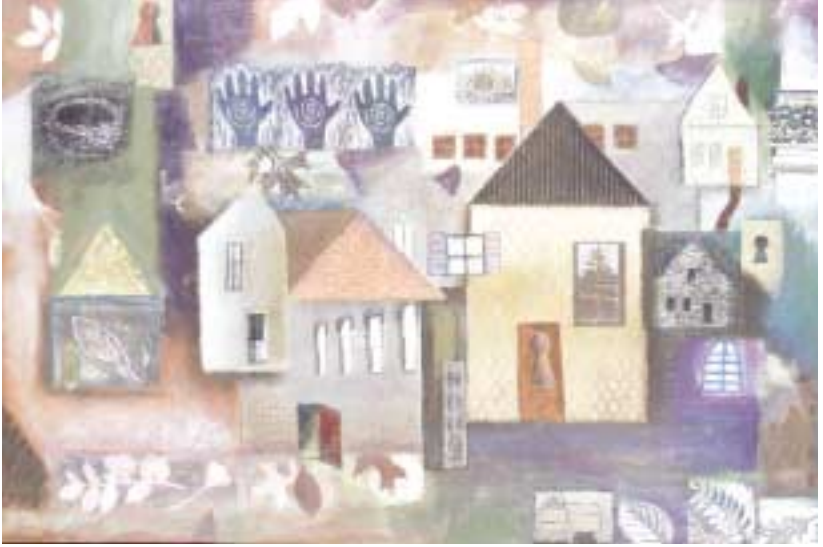
Three Keys | 2000, mixed media on canvas, 60 x 40 in.