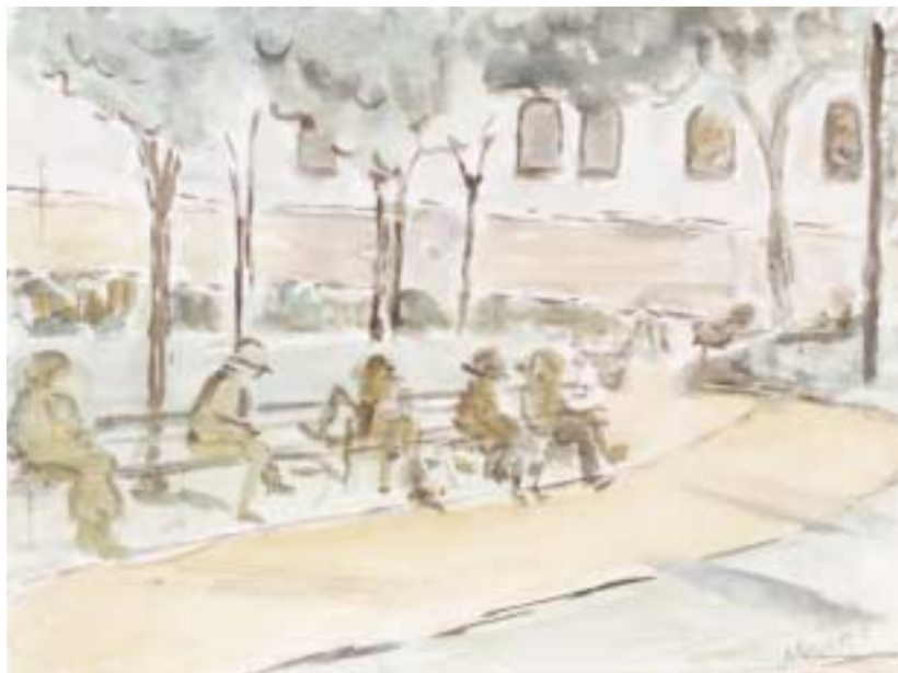
Rice Park | 1999, watercolor, 23 x 18 in.