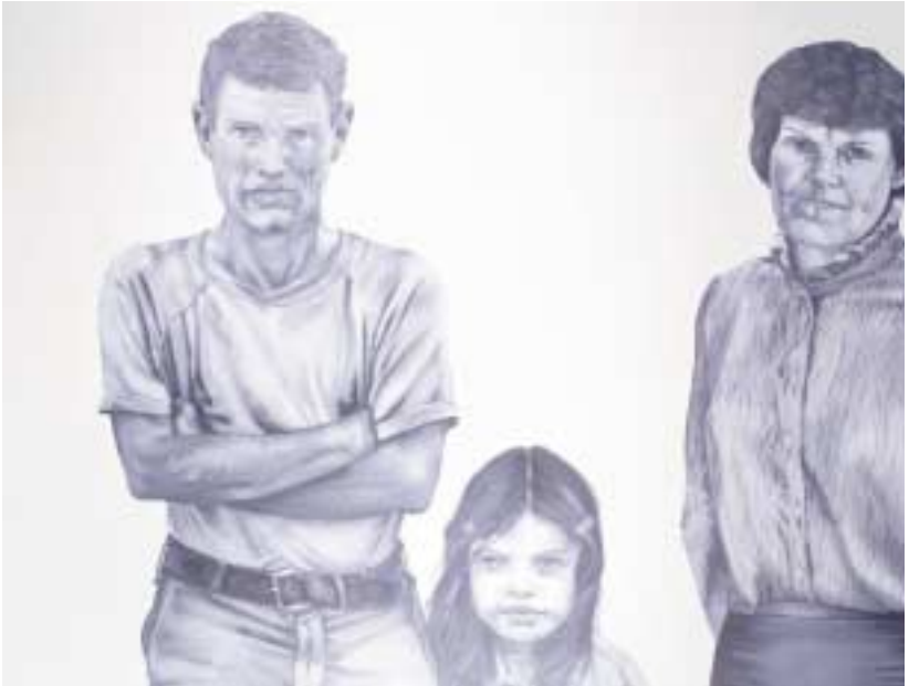
Untitled | 2000, oil on canvas, 72 x 36 in.