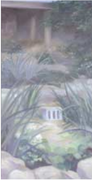
Our Garden's Architecture | 1994, oil on canvas, 24 x 48 in.