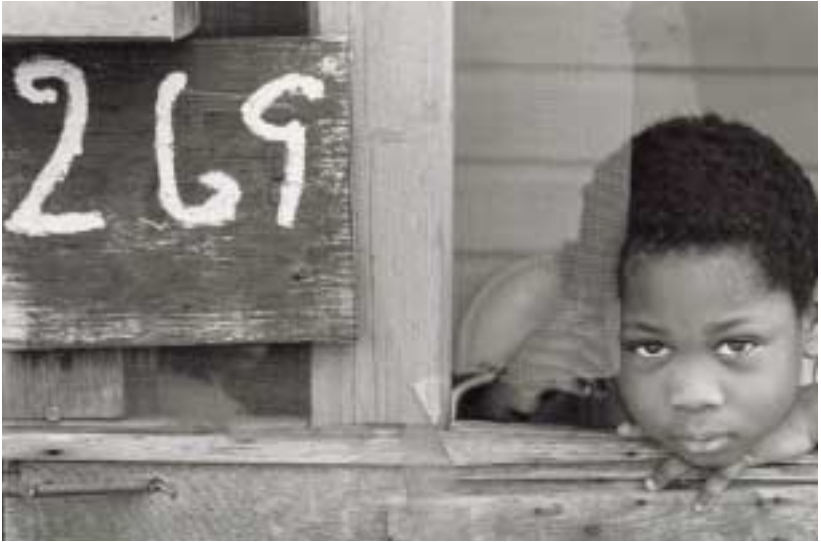
269 | 1999, silver print, 18 x 12 in.