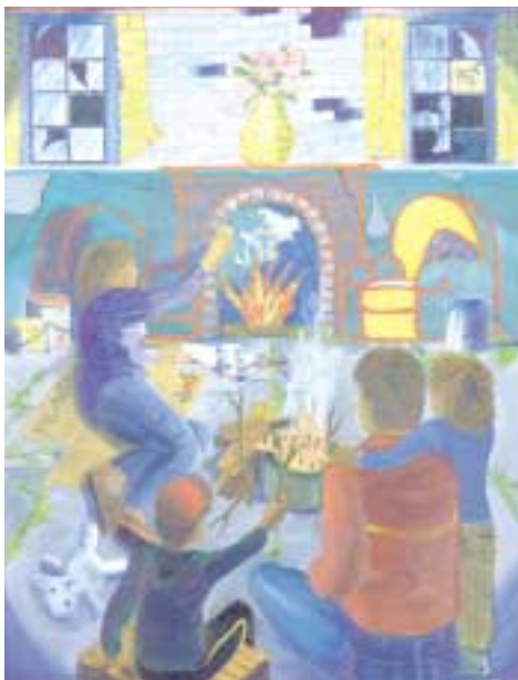
Homelessness: Playing with Fire 2000, oil on canvas, 33 x 43 in.