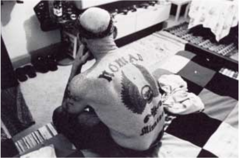
Nomad | 1993, silver print, 20 x 16 in.