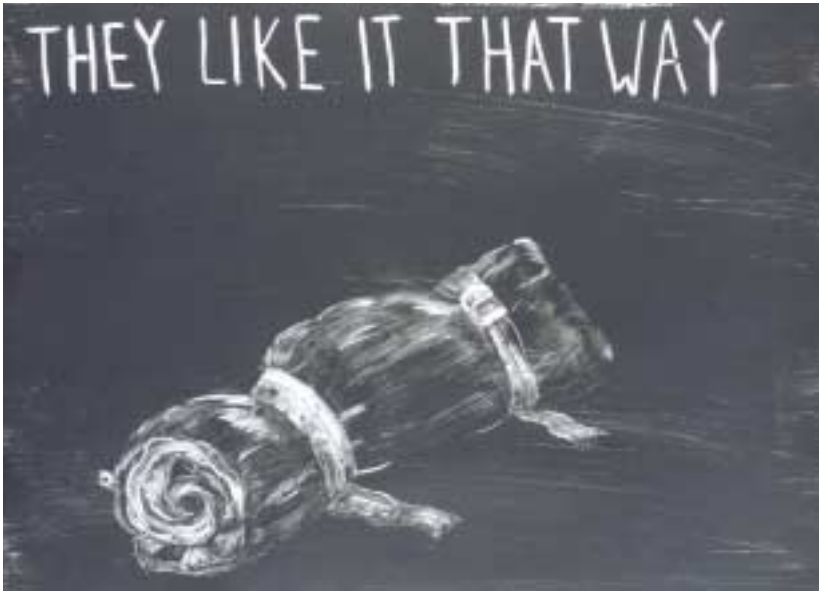
They Like It That Way | 2000, monoprint, 30 x 22 in.