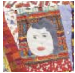
Untitled | 2000, quilting, 87 in. diameter, details above