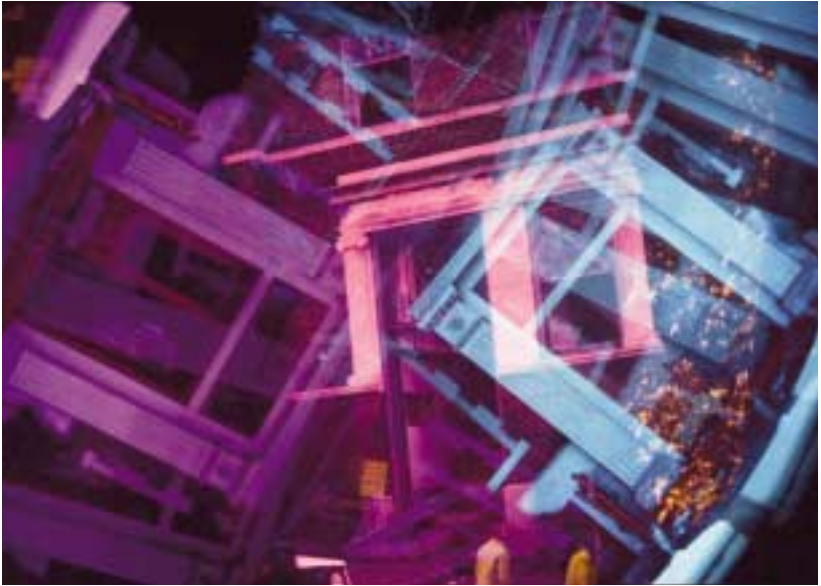
Urban Renovation #1 | 1996, cibachrome print, 20 x 16 in.