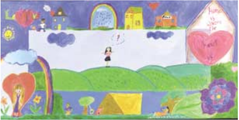
Home Is Where the Heart Is? | 2000, acrylic on muslin, 48 x 24 in.