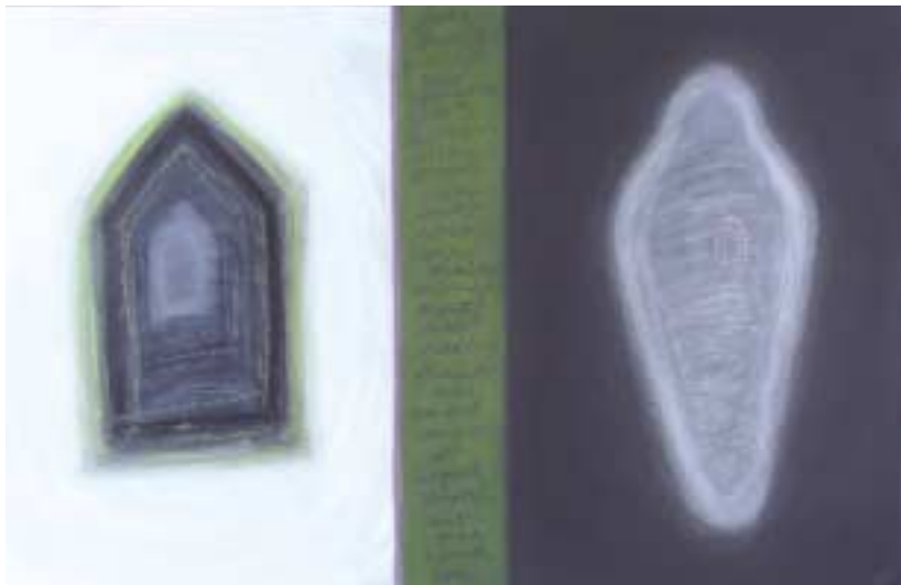
In the Heart of the Real | 2000, acrylic, pastels, chalk, graphite, 60 x 40 in.